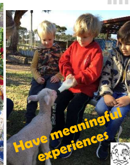
Have meaningful experiences