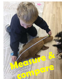
Measure & compare