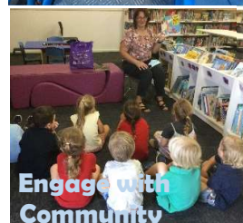
Engage with Community