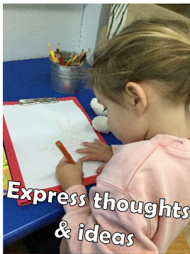
Express thoughts & ideas