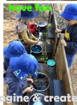
Play & have fun