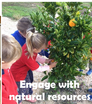
Engage with natural resources