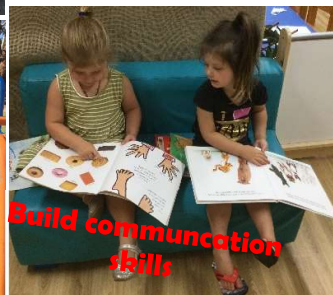
Build communication skills