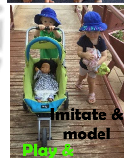
Imitate & model