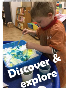
Discover & explore