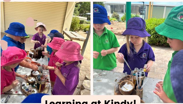
Learning at Kindy!