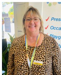
Sharon Preschool Support