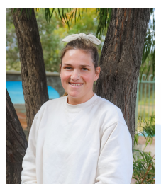
Zoe Learning Together Educator