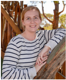
Peta Occasional Care