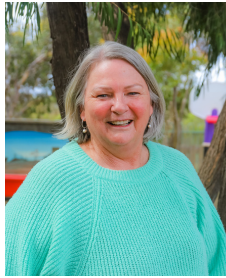
Kerry Community Development Coordinator