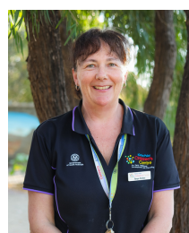
Tanya ECW Preschool