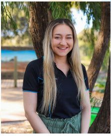
Alarna Preschool Support/Occasional Care