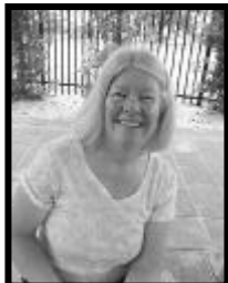
ELAINE THOMPSON SSO