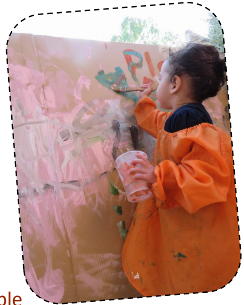
Learning Together Playgroup—learning with our special people