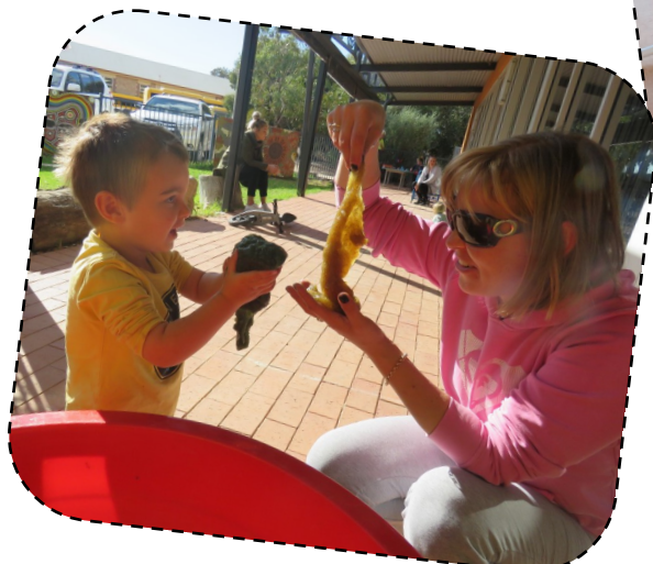
A wonderful opportunity for parents/caregivers to play and learn together.