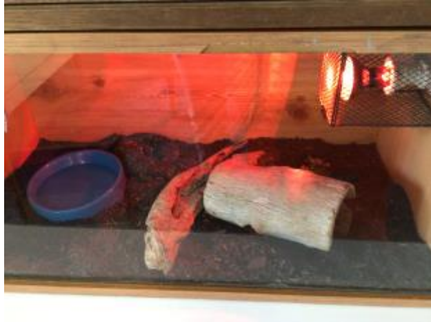
5 - lizards