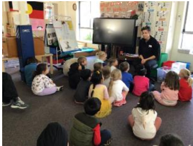
1 - KESAB

Please remember that we have children who are allergic to eggs and nuts and ask you to keep these at home. This includes nutella sandwiches, peanut butter and hard boiled eggs. Eggs cooked into biscuits and cake is ok.