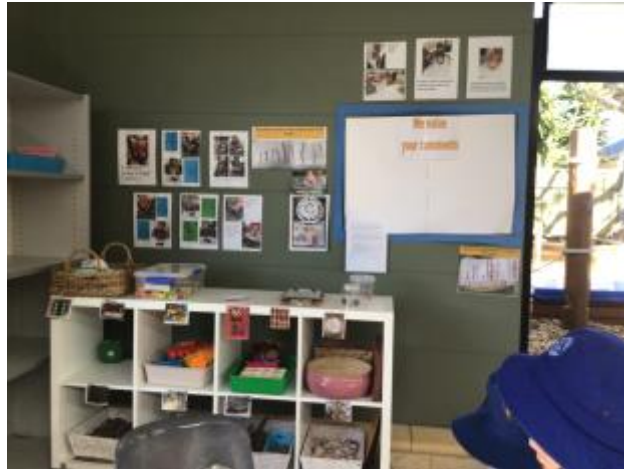
6 - Numeracy area