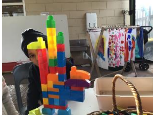
3 - maths in action

Enjoying the variety of learning at kindy