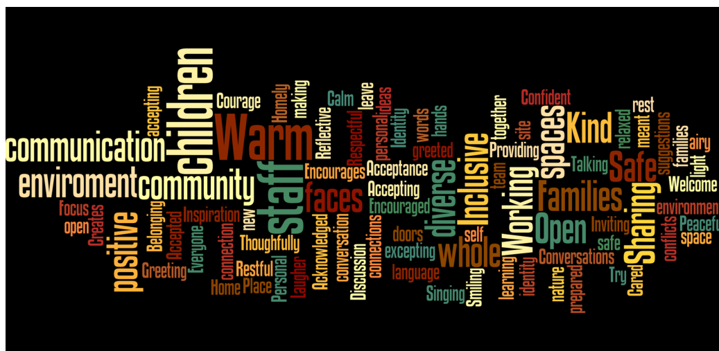
Taikurrendi Vision and Values in action